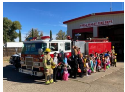
Oct 31, 2024 Halloween

Early last year we switched over to paid dispatch services provided by Mainstay (Rural Metro) in Glendale AZ, the same dispatch system used by all surrounding fire departments. This service also provides the incident reports. SVFD had 81