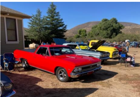
Oct 19, 2024 Car Show

Last year we purchased an upgraded Compressed Air Foam System (CAFS) that will replace the current unit on our Wildland Fire E40 engine in the coming months. The AED device that SVFD purchased for the community in 2023 remains available in The Forge coffee shop thanks to new owners Claire and Troy Eckard. The air compressor equipment donated by the Yarnell Fire Department was commissioned last summer and is now certified to fill the SCBA cylinders needed for fire fighting. As well as helping with some community water transporting duties, and supporting controlled burns, we were delighted to be part of Skull Valley's Elementary School Halloween event.