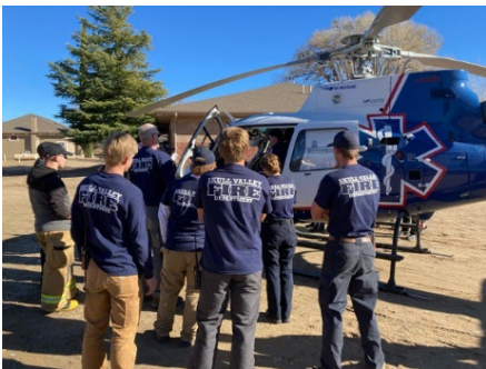
Helicopter Landing Zone Class

The first responders have completed several training classes including: Helicopter landing zone preparation and on-scene operations, radio and communication protocol training, and Wild Land Fire Fighting certification, which the latter allows us to be called in to support fires on public lands and to be compensated for services rendered. Our first responders also completed joint exercises with our neighbor, Southern Yavapai Fire Department (SYFD, Wilhoit), to test the interchangeability of fire-fighting equipment between the units.