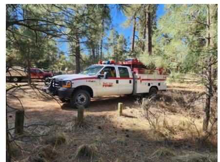
2024 Wild Land Basin Ops Training

Regular station workdays have and will continue to be conducted to test and maintain SVFD equipment. A major expense in the coming months will be having our Structure Engine's water pump rebuilt, which may be as much as $7,000. One of our absolute priorities is to make sure that when we are called to an incident, our equipment is fully functional!