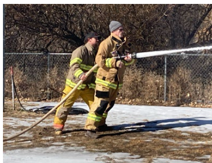
Practice Fire Fighting